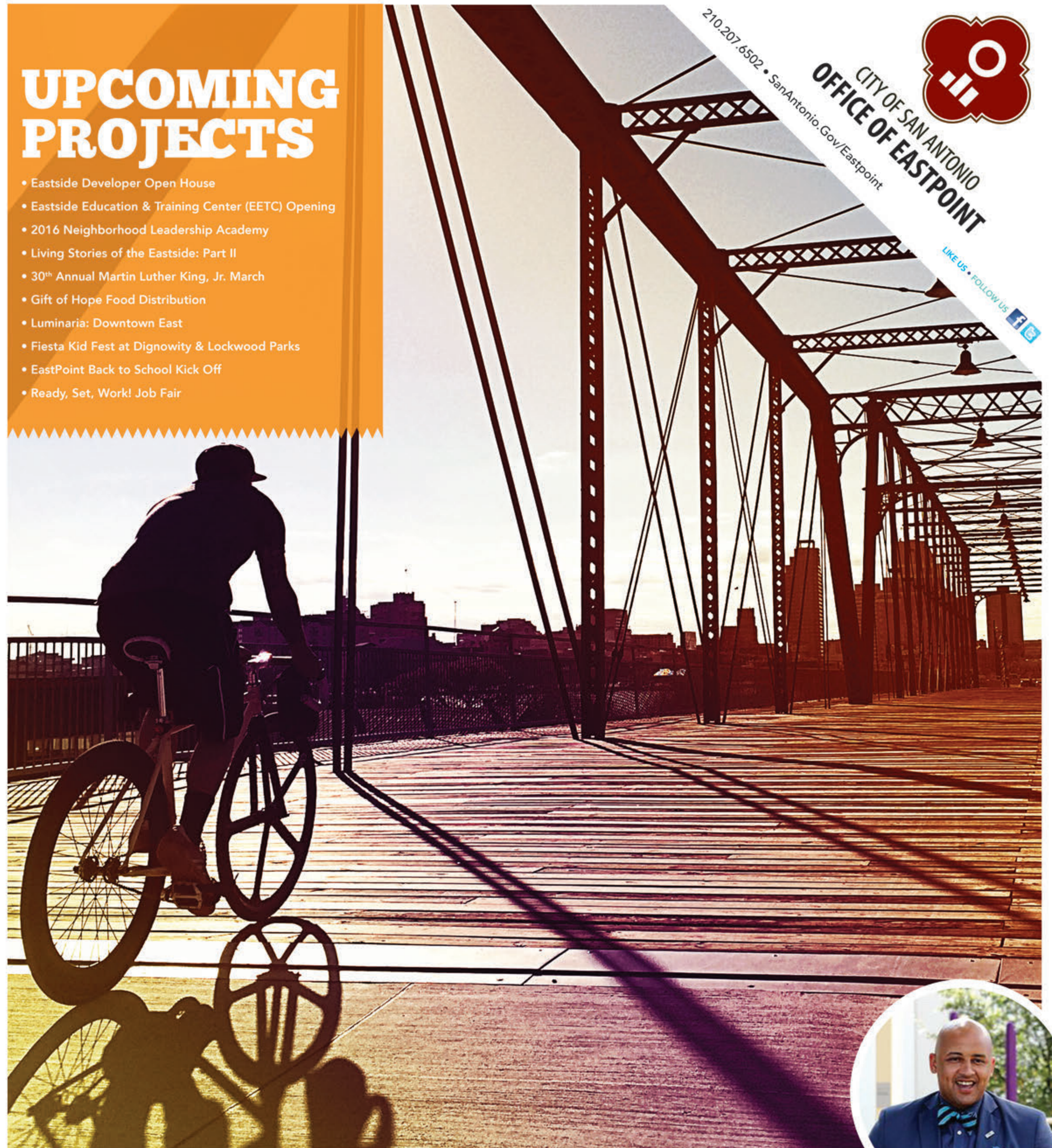
HAYS STREET BRIDGE, 803 N. CHERRY ST.